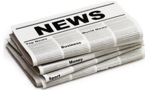
Newspaper, Phone Books & Paper Bags