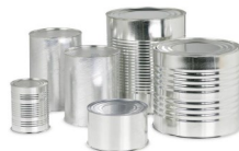
Metal & Tin Cans