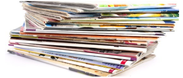
Magazines, Catalogues & Office Paper