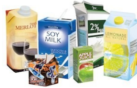
Milk & Juice Cartons