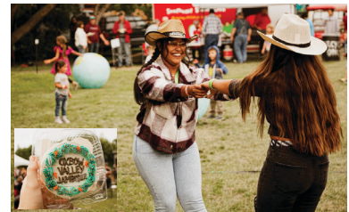
Bow Valley Jamboree