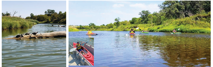
Oxbow's Bow Valley Park on the Souris River

Nestled along the beautiful Souris River, the Bow Valley Park is an outdoor enthusiast's paradise. It offers full-service campgrounds, a kayak launch, a boat launch, walking trails, potable drinking water, a children's playground, showers and bathrooms, ball diamonds, a batting cage, outdoor theatre, an RV dumping station. Reserve your site today letscamp.ca/camps/bow-valley-park