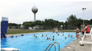
Oxbow Swimming Pool

Step into the past at the Ralph Allen Memorial Museum. Housed in a converted CN station, the museum displays a collection of historical artifacts of Oxbow and the area.