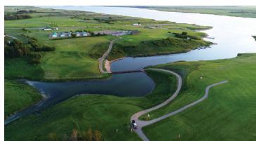
Moose Creek Golf Course

Moose Creek Golf Course is a beautiful grass-green nine-hole golf course. Power cart rentals are available. Moose Creek Golf Course is located 4 miles north and 1.5 miles west of Oxbow.